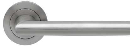
Verona- UER 37 Ø 2 5/8 x 7/16"